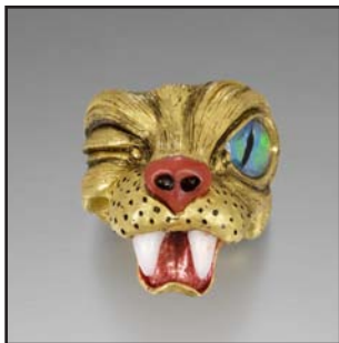
Kevin Coates, Ring, "Blink", 20k. Gold w/patination, Opal, Pink & White Coral.